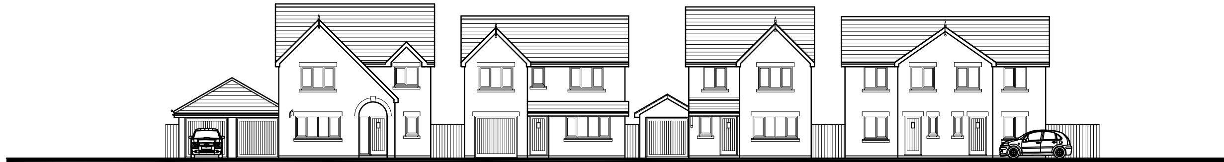
1. Type D