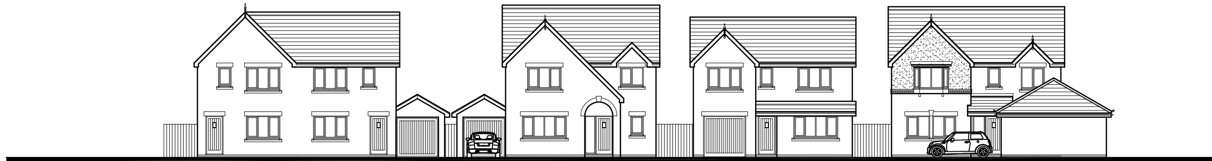
6 & 7. Type B